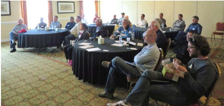
BPPP Live on Friday afternoon

The large draw for this event was the Bonanza Pilot Proficiency Program (BPPP) Ground School in conjunction with the American Bonanza Society. In keeping with our mission statement, this event promoted comradeship through group education, safety and fellowship. We had several of our regular SWBS attendees at this event, but also had several new comers of which many signed up to become SWBS members. Though, most of our attendees were from the surrounding area, I was happy to see participants join us from Arkansas as well as one attendee from Rhode Island!