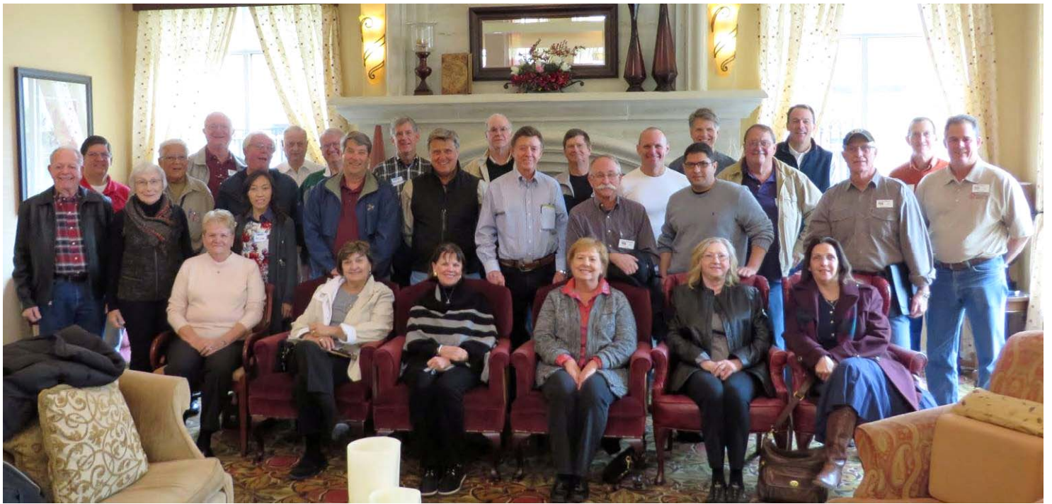
Attendees for SWBS BPPP Live Event at Hilton Garden Inn in Katy, TX